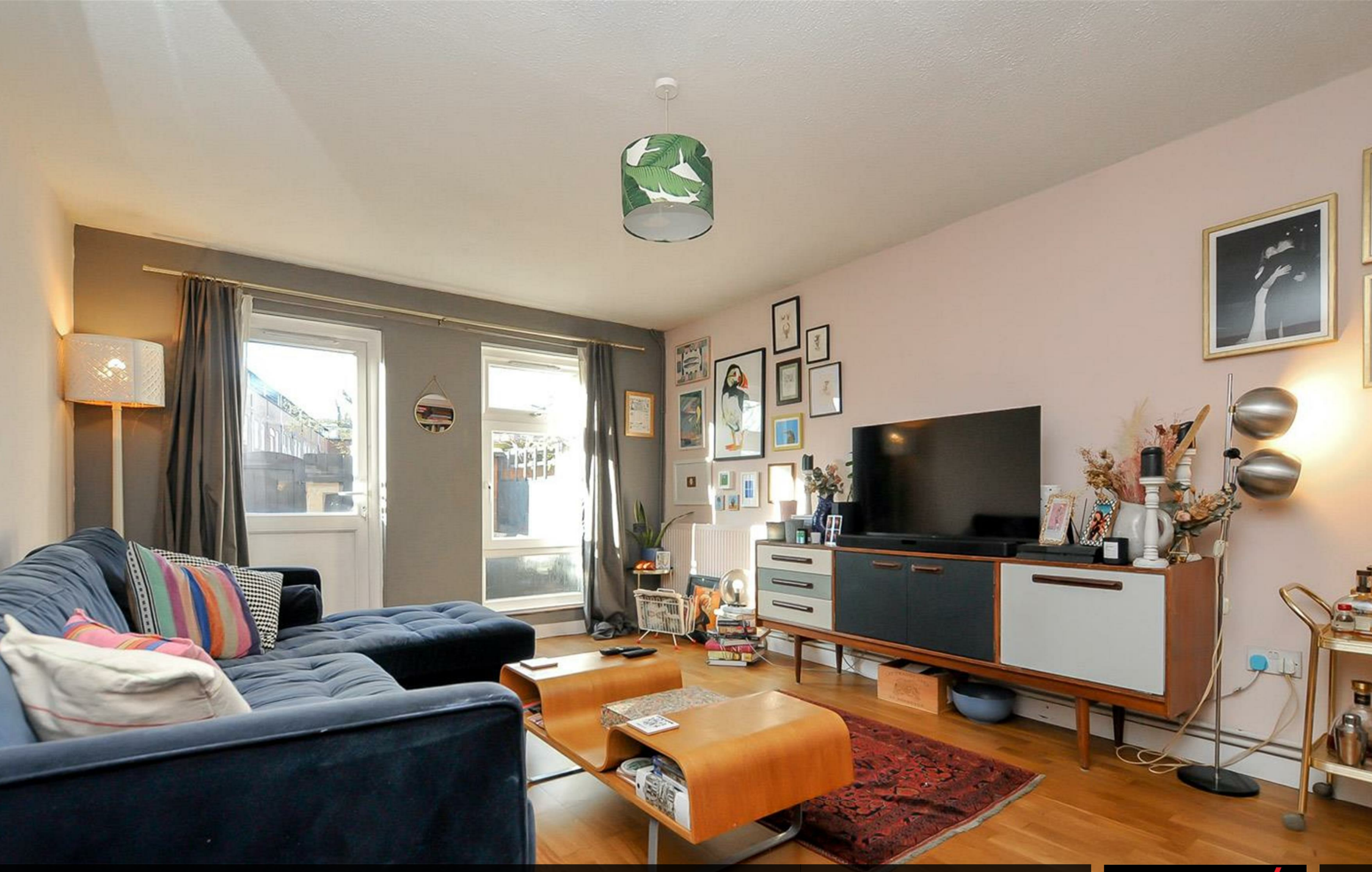
Garnham Close Stoke Newington, London N16