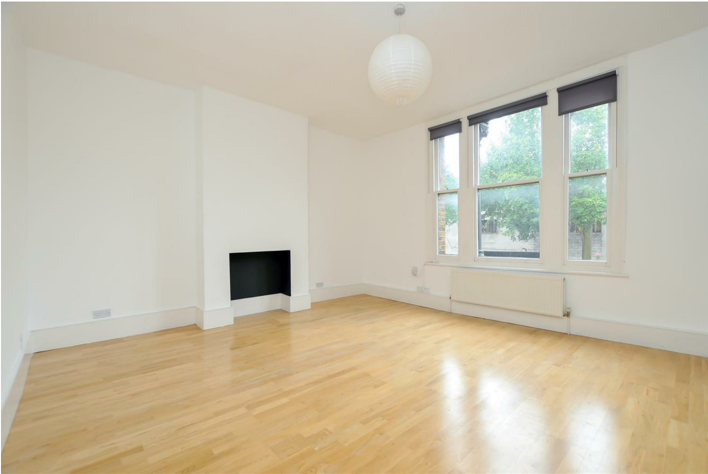
Illustration for identification purposes. Not to scale. All measurements are approximate and for guidance only. © Next Move 2012 Made with Metropix ©2012

Church Street, N16 Total Approx. Floor Area 562 Sq.Ft. (52.2 Sq.M.)